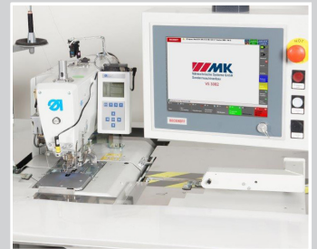
Automatic eyelet buttonholer detail screen