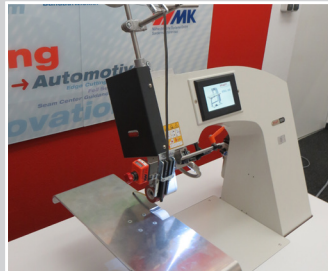
Adhesive Tape Applicators with supporting table.